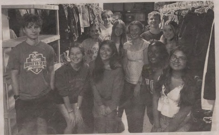
WHS Key Club members volunteering at the Glade Valley Thrift Shop in Downtown Walkersville.

Since Carbone took up the mantle, Key Club has seen a 4500% increase in members. From those 4 girls in 2010,