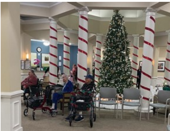
Partnering with the band and orchestra, THS Key Club brought some holiday caroling to the local nursing home Spring Arbor in Ballenger Creek Friday 12/20 just before winter break.