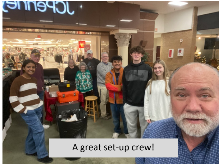
A great set-up crew!