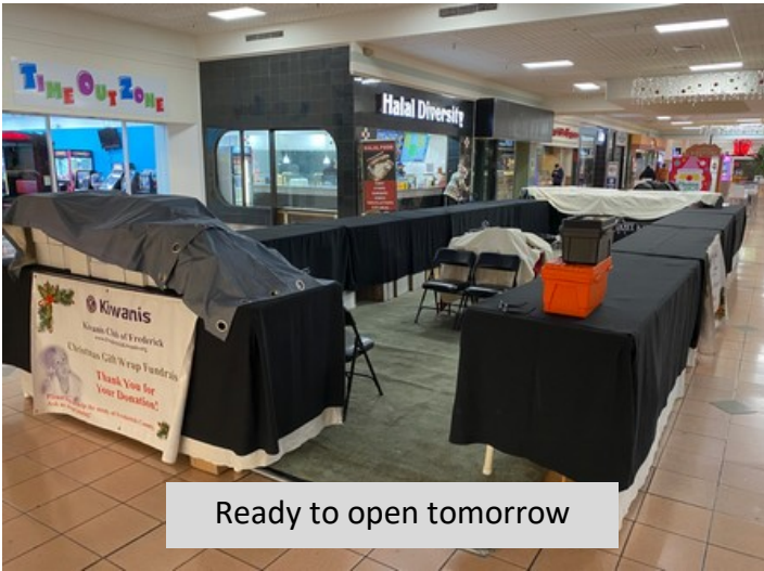
Ready to open tomorrow