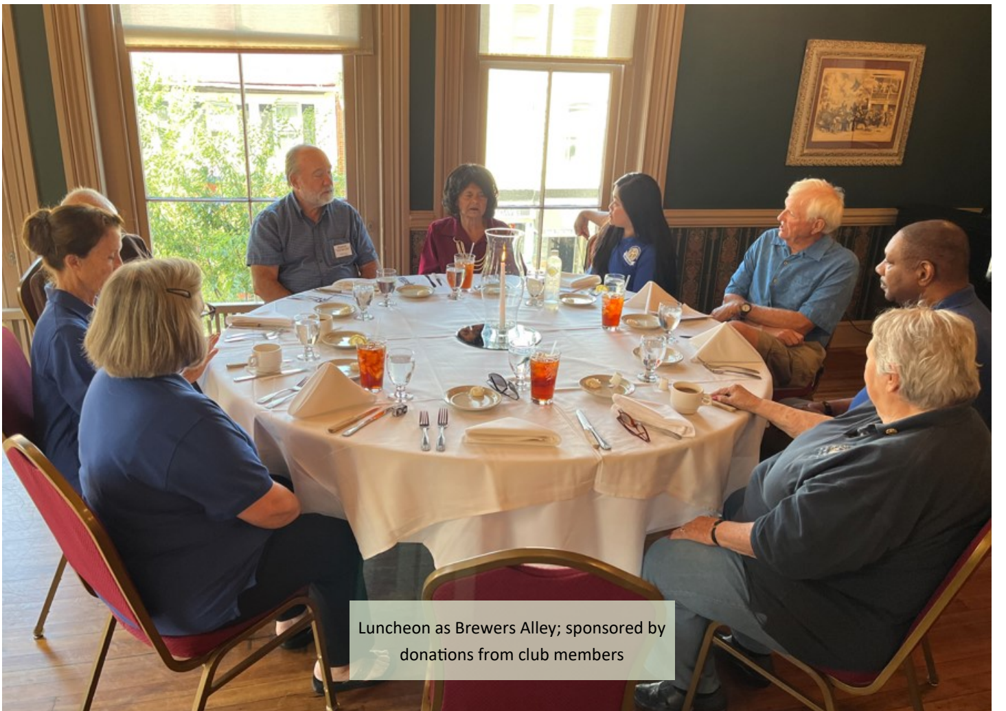
Luncheon at Brewers Alley; sponsored by donations from club members