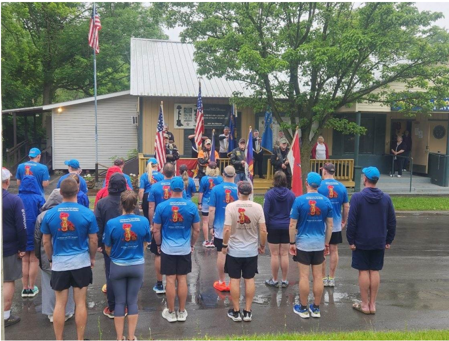
(Top left) Run participants