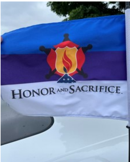
(Bottom) Run begins