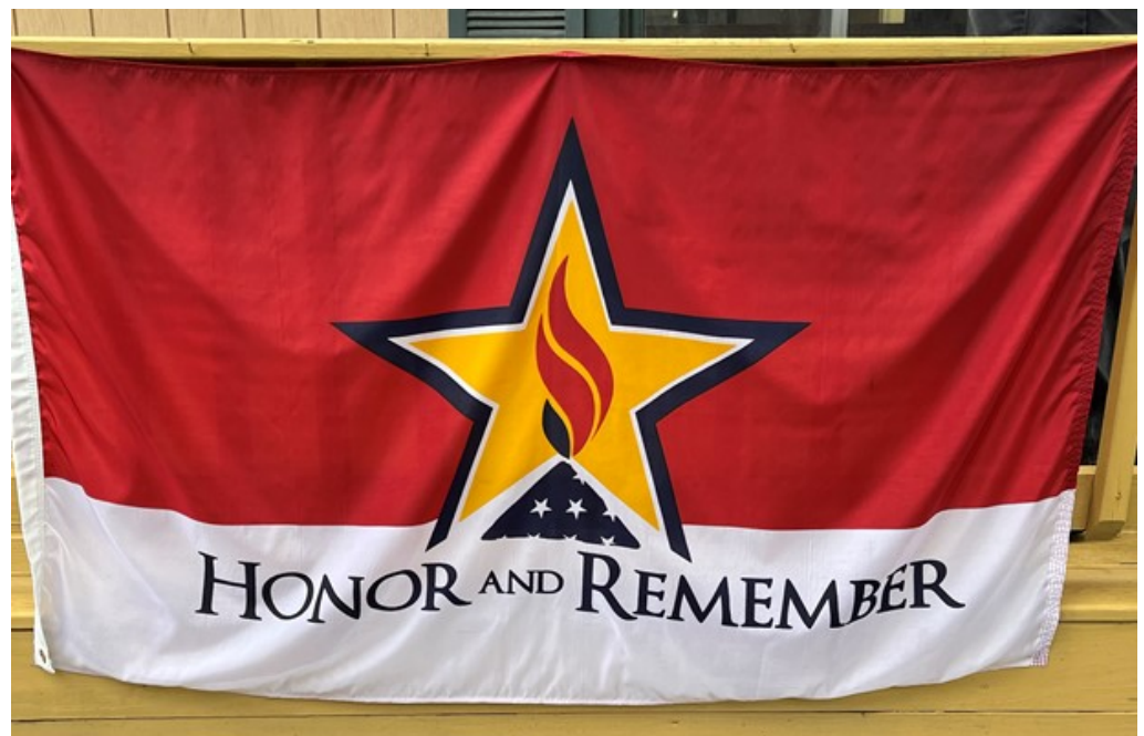
(Below) Honor and Remember flag.