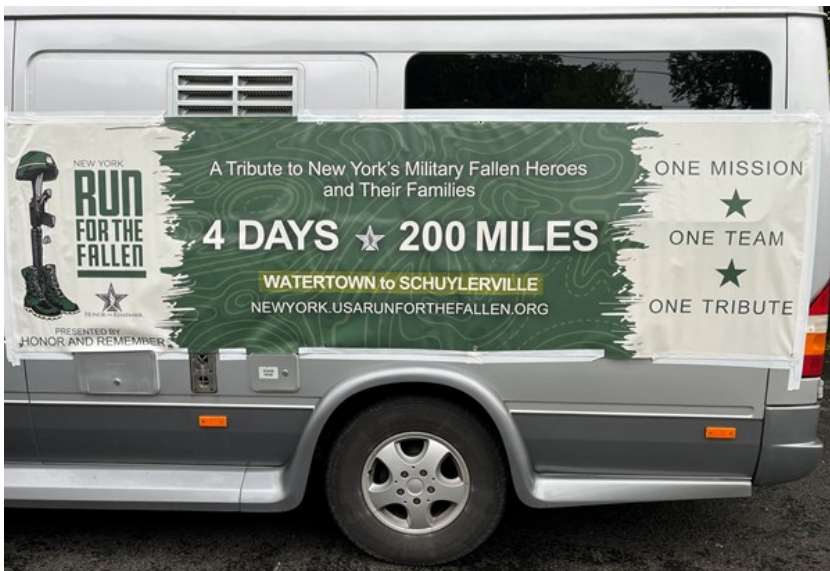
(Left) Support vehicle

This year was particularly trying as only Saturday afternoon was rain and wind free. (See pics on this page and the next.)