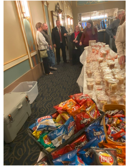
(Right) The Event offered light snacks prior to the show.