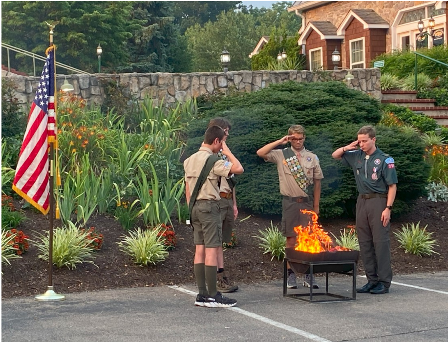
Troop 792's solemn flag retirement ceremony.