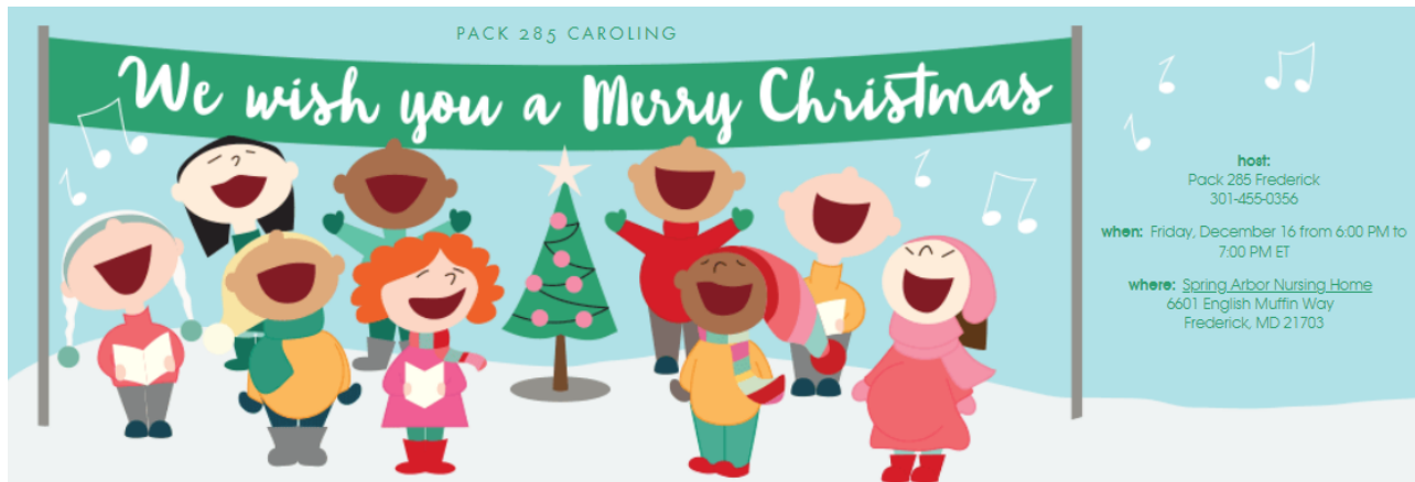
Above. Members of Cub Pack 285 will be Caroling at Spring Harbor Nursing Home on Dec 16th

Each year for their December Service Project, members of Cub Pack 285 are asked to sign up and provide gifts for children from the Giving Tree project at Tuscarora and Carroll Manor Elementary Schools.