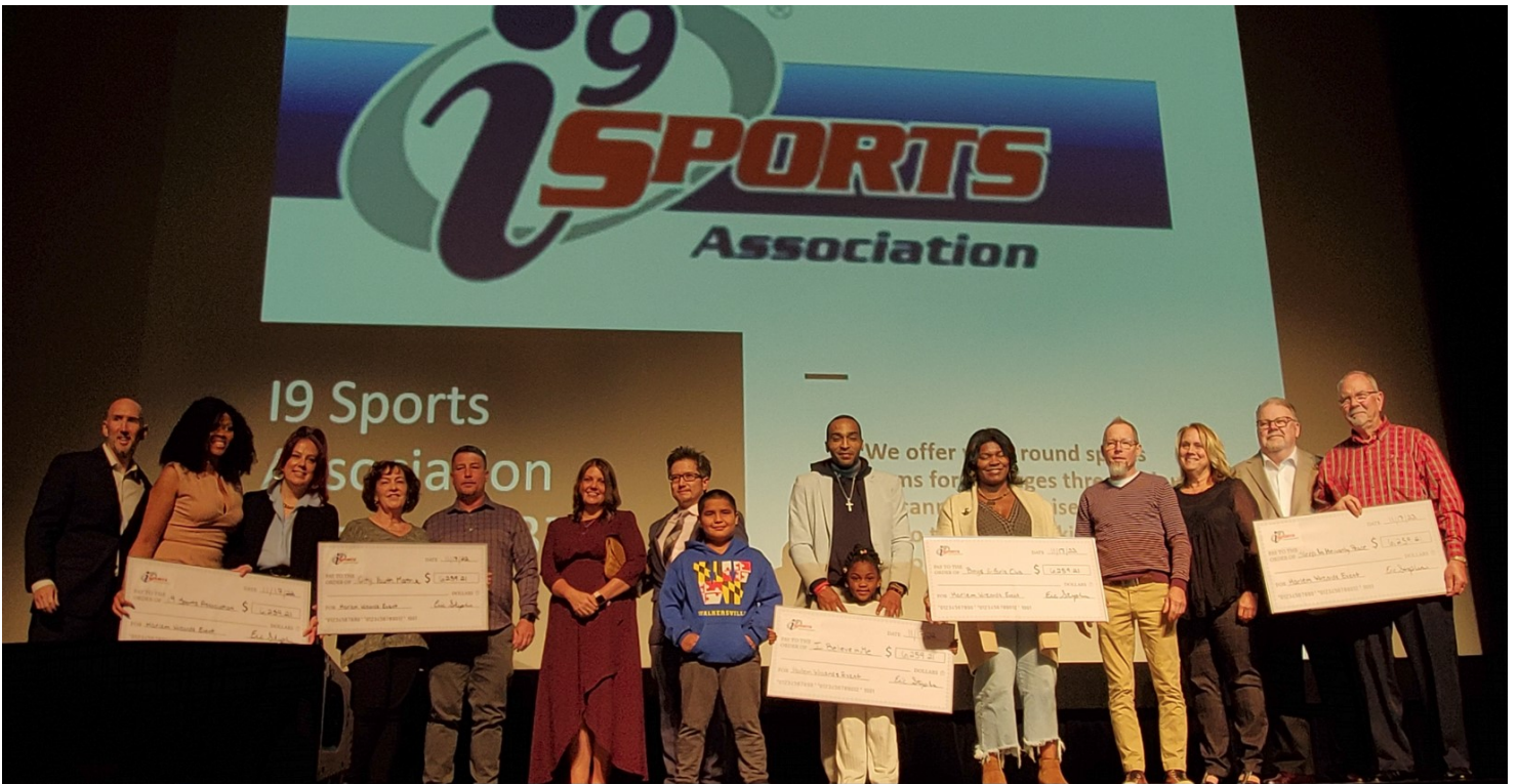
The Kiwanis Club of Frederick recently sponsored the Harlem Wizards vs. Team Frederick basketball game held at Frederick Community College. Proceeds from the event were donated to five local non-profit organizations, most of which are supported by our Club as well. Over $31,000 was raised at the Wizards event and the proceeds were distributed equally to the Boys and Girls Club, City Youth Matrix, I Believe in Me, i9 Sports Association Chapter 437 and Sleep in Heavenly Peace (shown above).