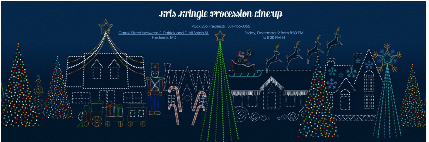
Above. Members of Cub Pack 285 will be marching in the Kringle Parade in downtown Frederick on Dec. 9th. Their float will feature a Scout campsite!