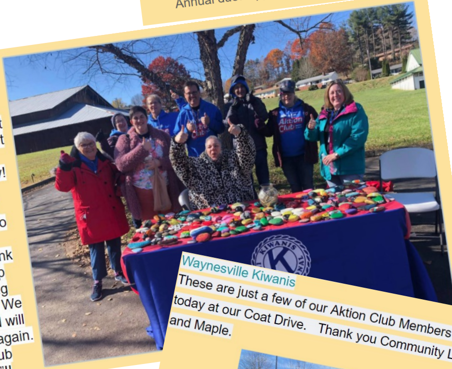
Waynesville Kiwanis These are just a few of our Aktion Club Members who helped today at our Coat Drive. Thank you Community Living, Farley and Maple.

Our Waynesville Kiwanis Aktion Club painted river rocks for several weeks and we sold them at the Farmer's Market on Saturday. We had a fabulous day! The Aktion Club members wanted the proceeds to go to our Kiwanis Playground. Thank you Maple Group home for painting over 150 rocks! We made $417 and will definitely do it again. "Our Aktion Club members rock"!!