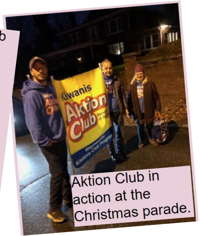
Aktion Club in action at the Christmas parade.

Fundraisers to buy Aktion Club gear and make donations to charities in our area.