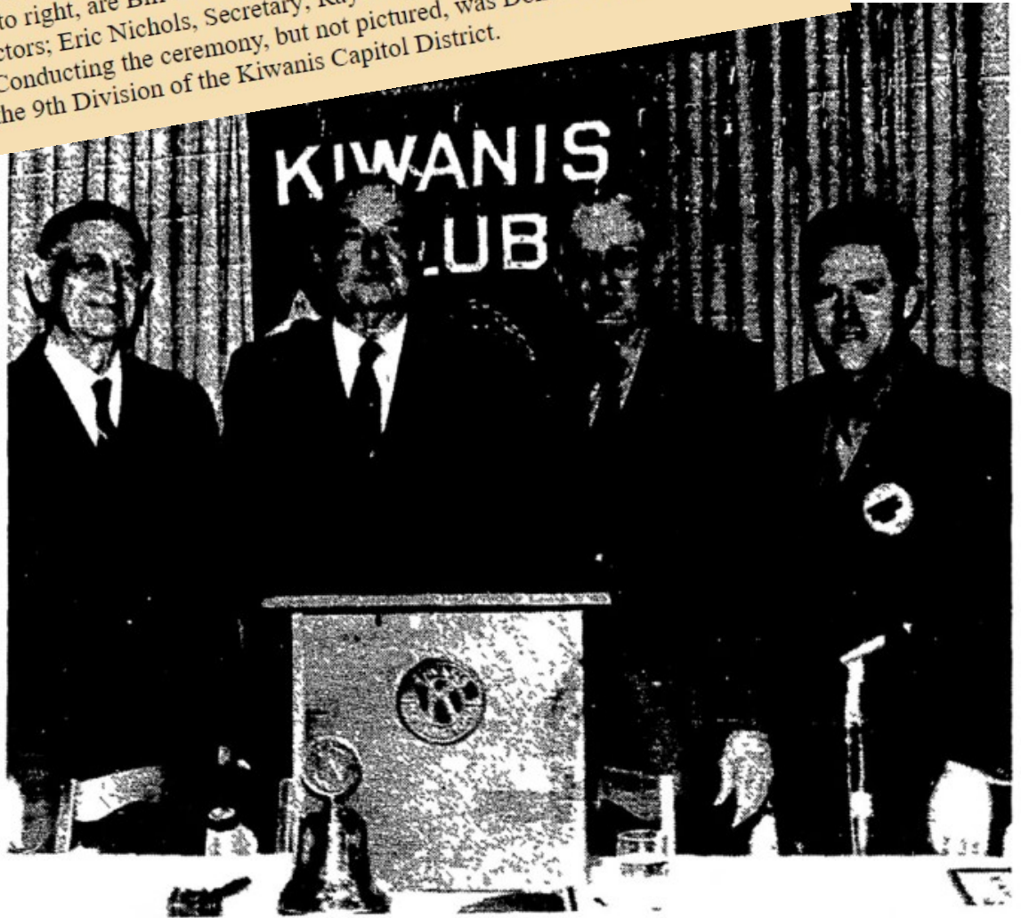
The Frederick News Jan 20, 1971