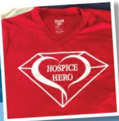
sample of t-shirt

Registrations and sponsorships are accepted by phone, mail, and at frederickhealthhospice.org .